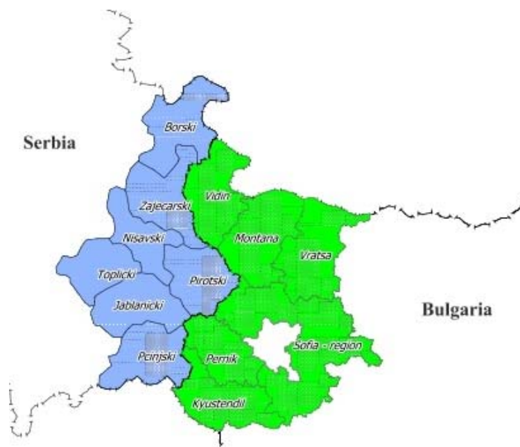
Fig № 1.2-1 Territorial scope of the CBCP 2021-2027 between the Republic of Bulgaria and the Republic of Serbia